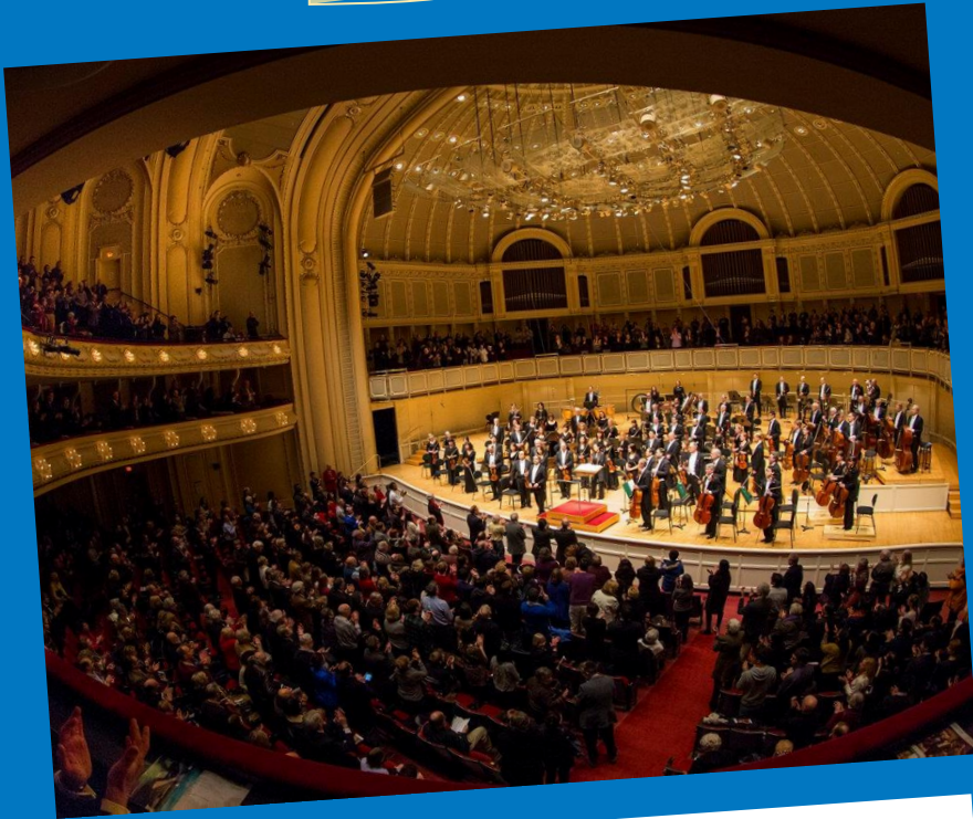
The Chicago Philharmonic