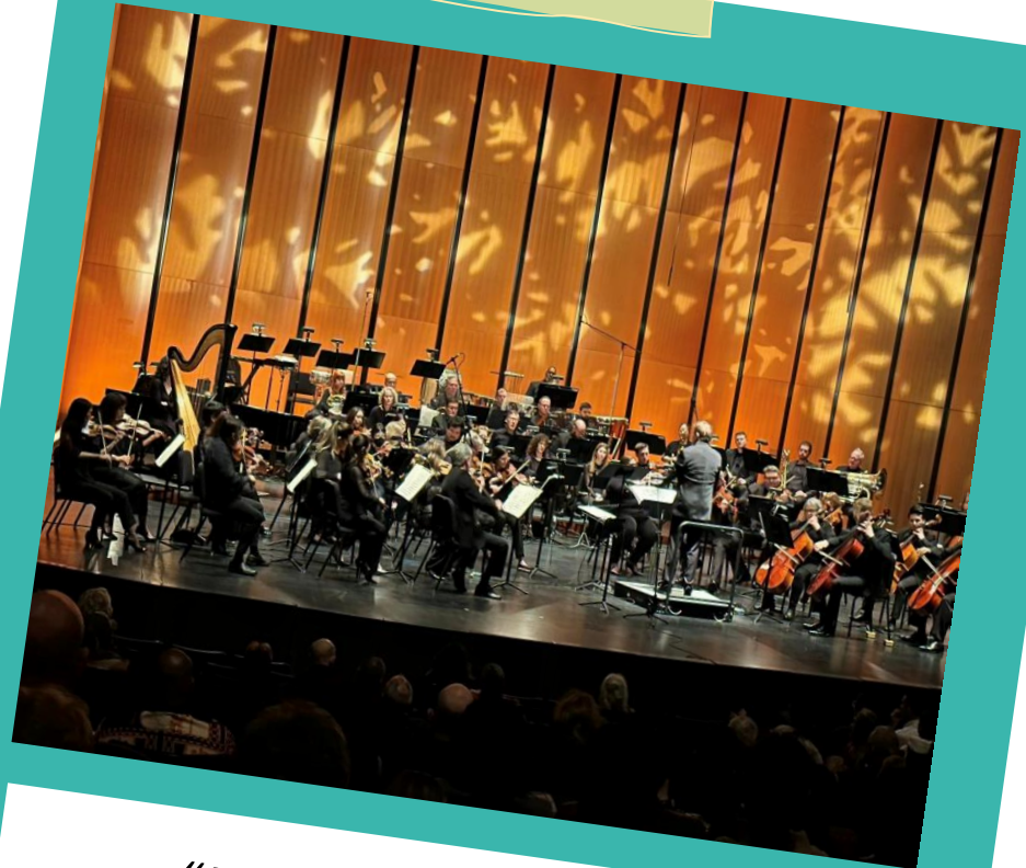
"A truly valued sponsor"